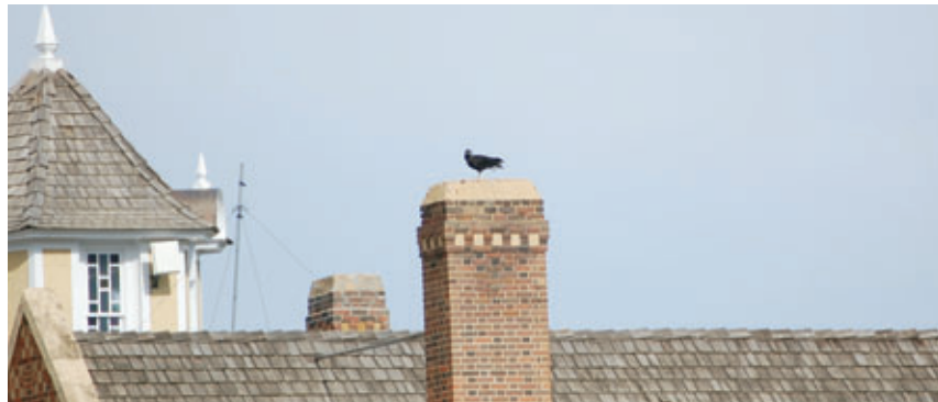
A BLACK VULTURE IN RAYMOND AB, THE PROVINCE'S FIRST DOCUMENTED RECORD. LORI SMITH

Bewick's Swan ( Cygnus columbianus bewickii ): SE of Lethbridge; 29 October 2011; 2 images (Ken Orich). CODE 1 RECORD.