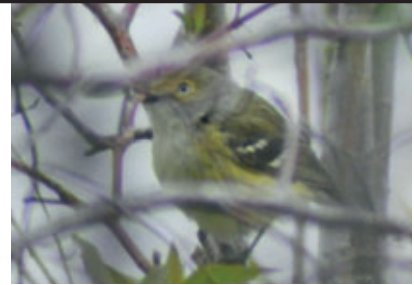
A WHITE-EYED VIREO, ANOTHER FIRST FOR ALBERTA.